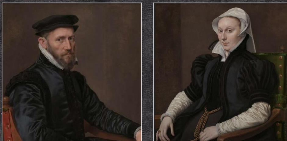
Portraits of Sir Thomas Gresham and Anne Fernely, Anthonis Mor, c. 1560 - c. 1565, oil on panel, h 90cm × w 75.5cm, Copyright Rijksmuseum, Amsterdam

This edition of the Technical Art History Colloquium is organised in collaboration with Museum Hof van Busleyden, on the occasion of the exhibition Back to Black (21-06-2019 – 21-06-2021). The colloquium will have the format of a mini symposium and serve as an introduction to the exhibition. The event is free of charge, but please make sure to register through an email to j.briggeman@uu.nl before June 13. Only registered attendants of the colloquium will receive an invitation for the vernissage of the exhibition at the Museum Hof van Busleyden (starting at 19:30).